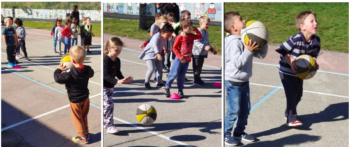
Uenuku tamariki shooting hoops - what great concentration!

All students have participated in basketball coaching sessions as part of PE this term. The cost per student is $26.00 however the school is subsidising this extra curricular activity. Please pay $15.00 per student via Kindo or via the school bank account 12-3223-0115693-00. Alternatively send payment to the school office in a named envelope - thank you. For more information please speak to Class Teachers or at the Office. Thanks to families who have already paid.